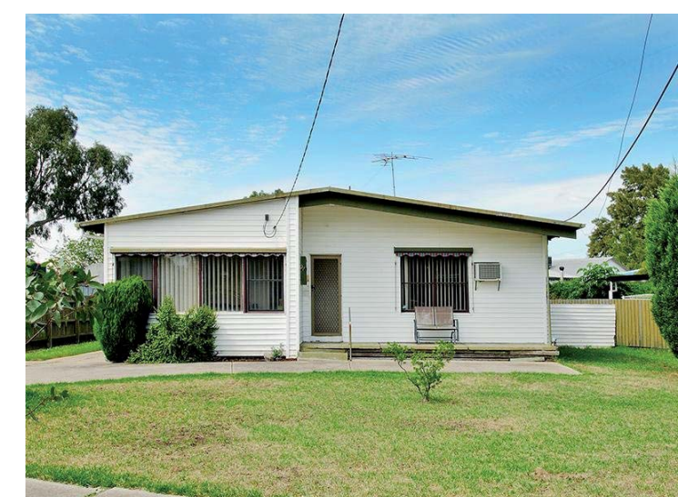
wood finish houses